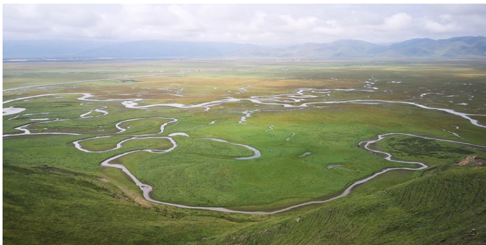
Peatland Marshes in the Wetland of International Importance Gansu Yellow River Shouqu Wetlands, China

crane and grazing grounds for traditional livestock farming. Large-scale peatland drainage, intended to increase fodder productivity, resulted in substantial deterioration of the hydrology of these peatlands.