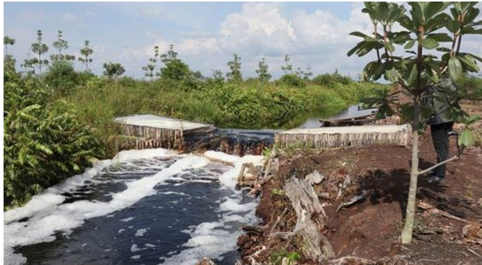
Drainage ditch block and paludiculture in the surroundings of the Wetland of International Importance Berbak National Park, Indonesia