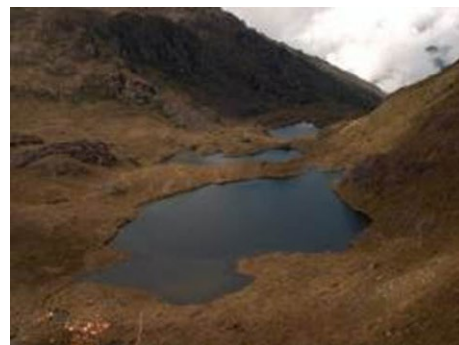
Chirripó National Park, Wetland of International Importance Turberas de Talamanca, Costa Rica

Countries within the High Andean Region of Central and South America understood the impact of peatlands on the local communities there.