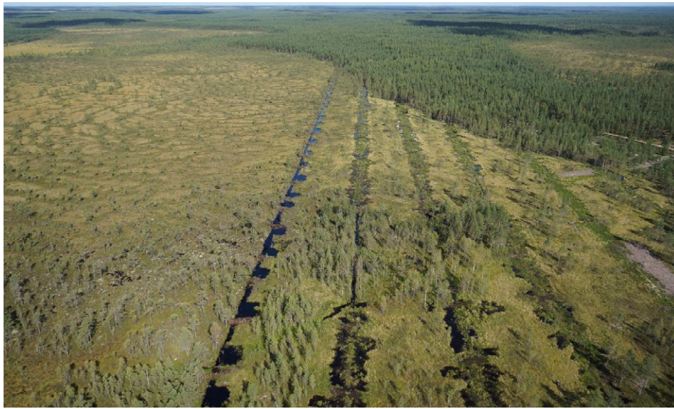
Restored edges of a mire complex in the Wetland of International Importance Kauhaneva - Pohjankangas National Park, Finland

Peatlands cover an impressive part of the land in Finland (30%). Although peatland cover in absolute terms is larger in Canada or Russia; the relative values for these countries would only be about 12% and 8% respectively.